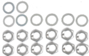
Shaft Nuts and Washers

Attach the Detroit RetroRadio™ face to the radio body using the radio face mounting screws included. (These screws are very small. Be careful not to lose them)