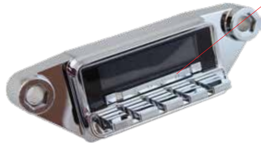
Detroit RetroRadio™ Face

The FORD Bar™ on your radio functions as a seek on SiriusXM or tuner mode and will skip tracks, rewind and fast-forward in USB or Bluetooth® playback modes.